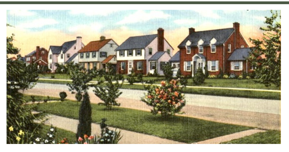
Vintage Spring Scene, Huntington Avenue Circa 1950

August 9, 2011 NEHHPA Board Meeting September 10, 2011 NEHHPA Summer Social