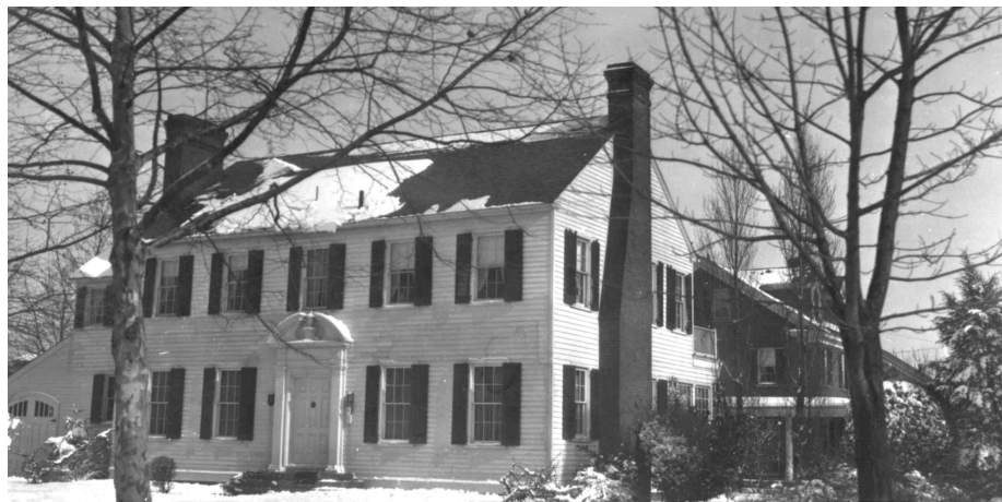
Vintage Winter Scene, Huntington Avenue at 59th Street