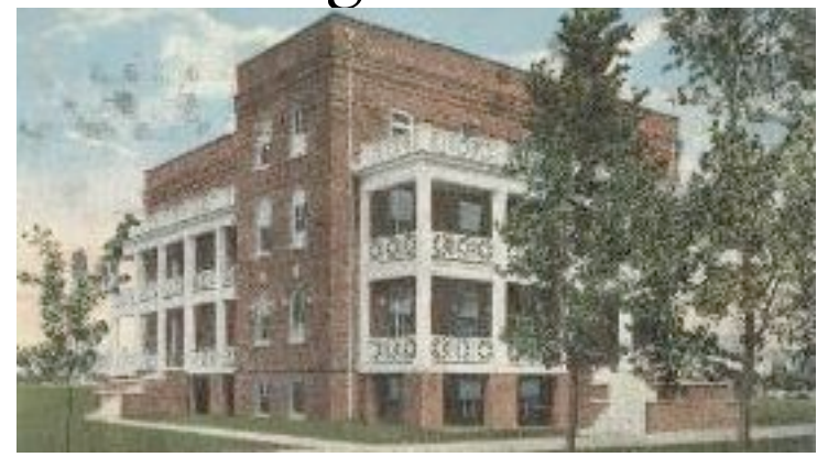
Original Riverside Hospital, Corner 50th and Huntington, 1916

Breathing Life Back Into Our Neighborhood