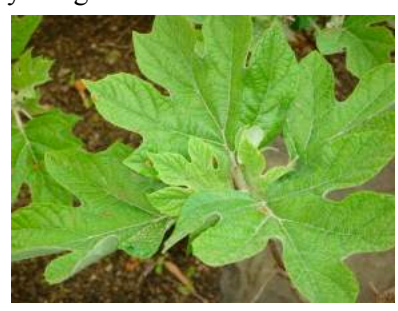
(See The Gardening Bug, Page 6)

We approach garden #2. At the entrance is a beautiful butterfly maple tree, oncore azaleas (these types of azaleas bloom two to three times a year in the spring, fall and winter!), american boxwood (there are actually two types – Japanese and American – the Japanese boxwood is more common), a prize oak leaf hydrangea and a verigated hydrangea.